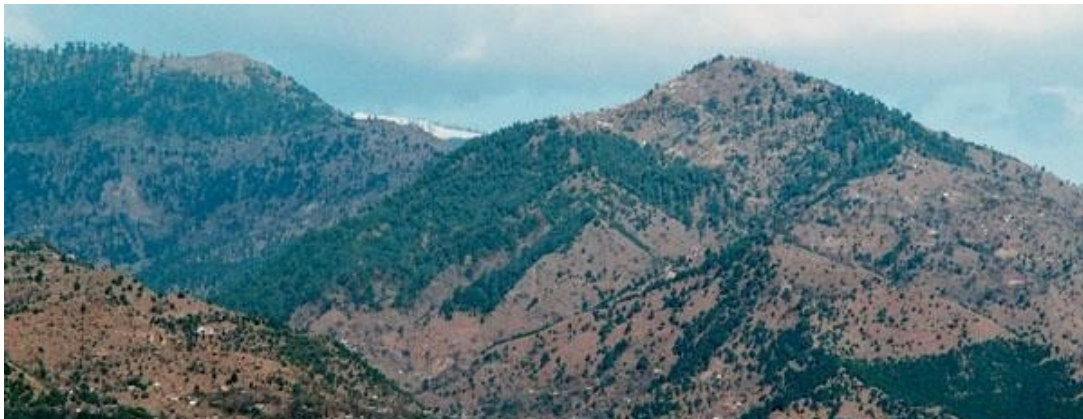
Human induced denuded area

Illegal logging, fires and forest conversion are driving much of the destruction. These are complex issues in the area, often with social and economic roots(WWF International 2005). According to (Kettunen and Brink,2006)“if private decision-makers are not given the incentive to value the larger social benefits of conservation, their decisions will often result in inadequate conservation”.Currently, topsoil is eroded annually in the area and arable land shows signs of erosion (Potstone, 2006).Indigenous communities has private owned lands and involve in timber wood trade without any authorization and due to this rationale ,old and broad leaved trees are cut down. There is an other strong notion has been developed in peoples minds that if they cut and chop up all the shrubs and trees from their own lands it will improve grass production for their domestic animals and now the area is totally nudes and under the great threat of soil erosion and degradation(Rehman ,2007).